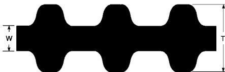
Fig. 37 Double-Sided Belt Tolerances

Double-Sided Belts can transmit 100% of their maximum rated load from either side of the belt or in combination where the sum of the loads exerted on both sides does not exceed the maximum rating of the belt. For example, a Double-Sided Belt rated at 6 lb-in could be used with 50% of the maximum rated on one side, and 50% on the other; or 90% on one side, and 10% on the other.