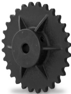
A 6T 7-2528