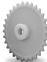
A 6M 7-3709