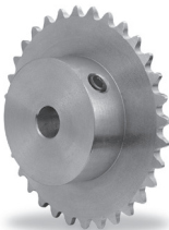
A 6C 7-25B09