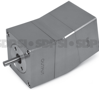
Fig. 1: 1-Way Direction with Overrunning Clutch

Min. Efficiency: 75% Backlash: 15 arc min.